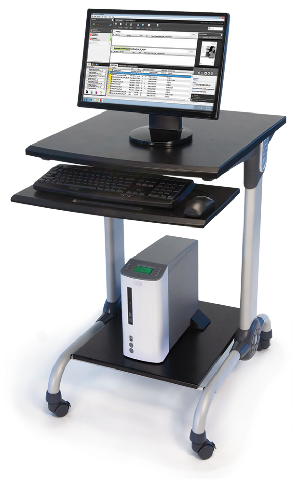
NOTE: Product shown with optional workstation.

uniFLOW software (optional) can communicate with the imageRUNNER ADVANCE 8500/6500 Series through the Canon imagePASS-Y2, allowing you to take advantage of the full suite of uniFLOW modules.