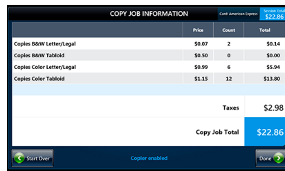
Costs and total charges are clearly shown.