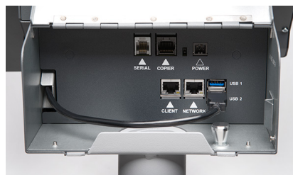
The back of the M600 station provides easy network connectivity behind a locked enclosure. The M600 station employs comprehensive measures to ensure physical and data security.