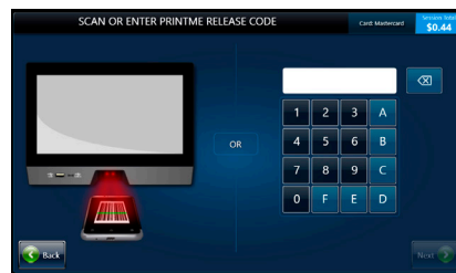
The M600 station provides convenient ways for mobile printing, such as scanning PrintMe release code to retrieve files from the cloud.