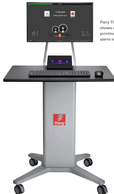
Fiery Ticker shows at-a-glance printing status and alerts to operators.

Fiery QuickTouch™ software on the touchscreen display of the server gives faster views of job status information and access to server management. With just a tap, the display gives operators easy access to intuitive system installation, backup and restore functionality, plus system diagnostics.