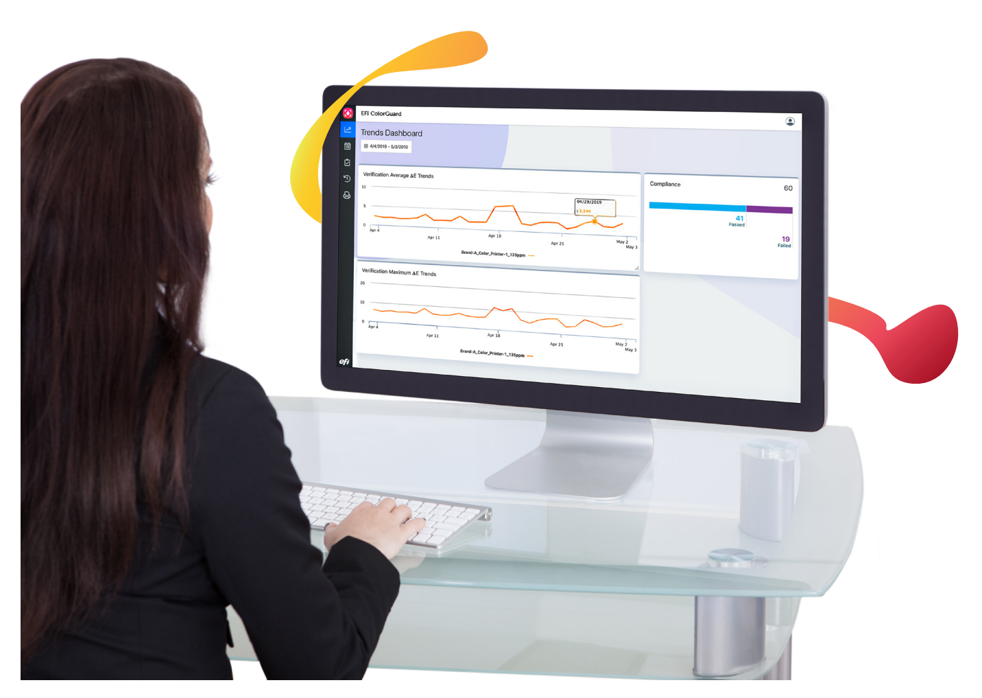
Monitor color verification trend from ColorGuard data analytics.

\mathrm{EFI}^{\mathbb{T}} ColorGuard ^{\mathbb{T}} helps you streamline recalibration and color verification of your digital presses and create unique reference standards. It works alongside color management tools to keep color results on target as printer and environmental conditions change. It compares colors with your custom reference or industry standard so you can measure color quality performance and share data across your print operation. With ColorGuard, your production teams can rapidly respond to always keep color on target.