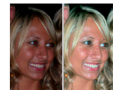
Image Enhance Visual Editor, a Command WorkStation® plug-in, allows operators to make last-minute edits to a selected image without having to open the image in applications such as Adobe Photoshop®.