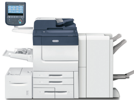
Xerox PrimeLink C9065/C9070 Printer