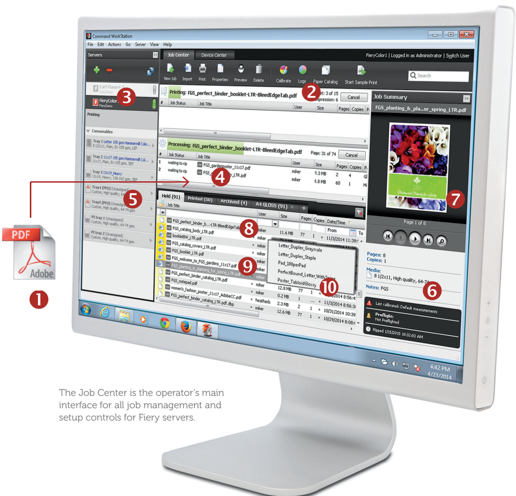
The Job Center is the operator's main interface for all job management and setup controls for Fiery servers.