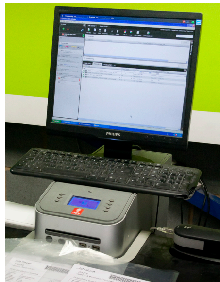
Fiery data is central to an automated scheduling system that will optimize production time and help operators plan their work.

It's likely that ongoing analysis of production data will drive wider procedural changes at PODW. "Increasing throughput by just five per cent can change how something is best done," explains Roach. "We're constantly reviewing potential bottlenecks."