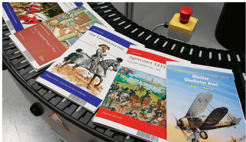
PODW prints and dispatches thousands of books a day, including both soft and hardcover editions, all printed and finished in-house.

MATTHEW AITKEN, WEB/IT DEVELOPER PRINTONDEMAND-WORLDWIDE.COM