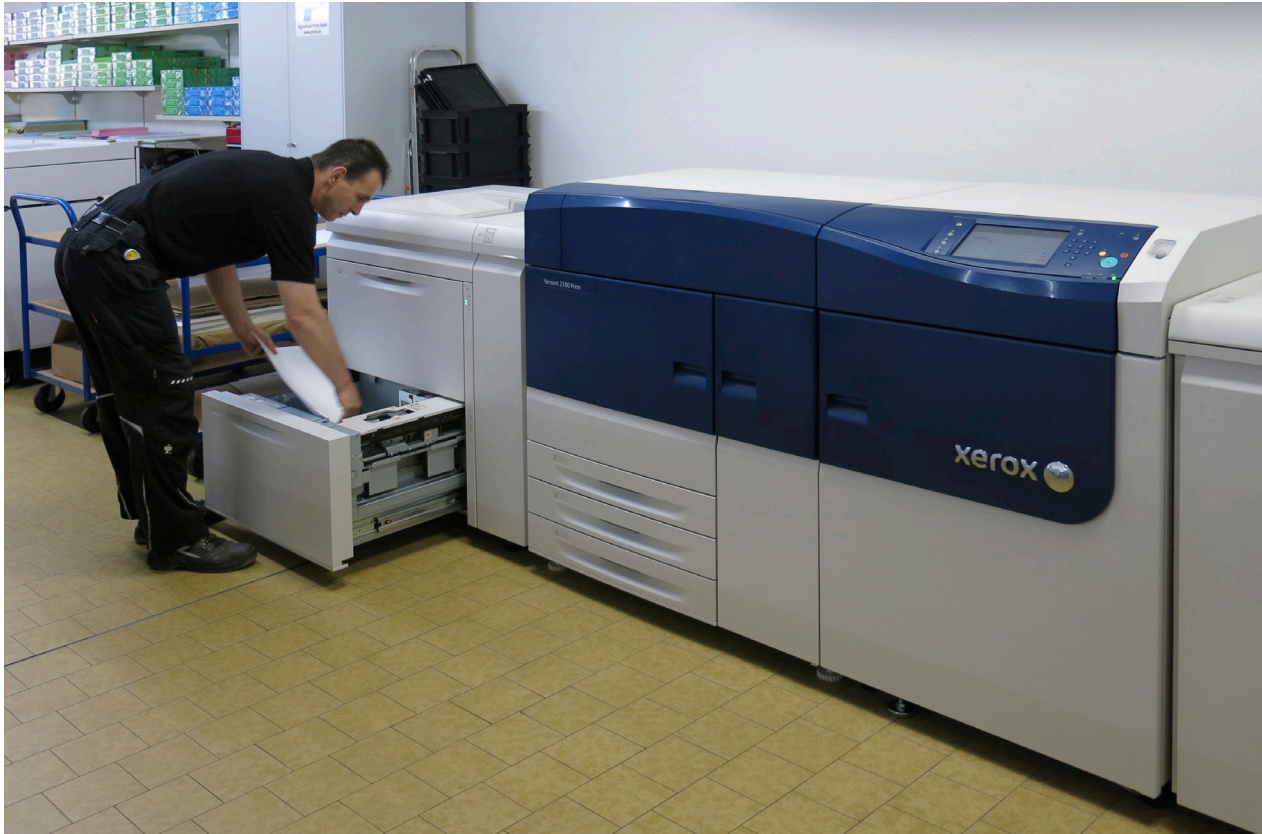
The Versant 2100 Press.